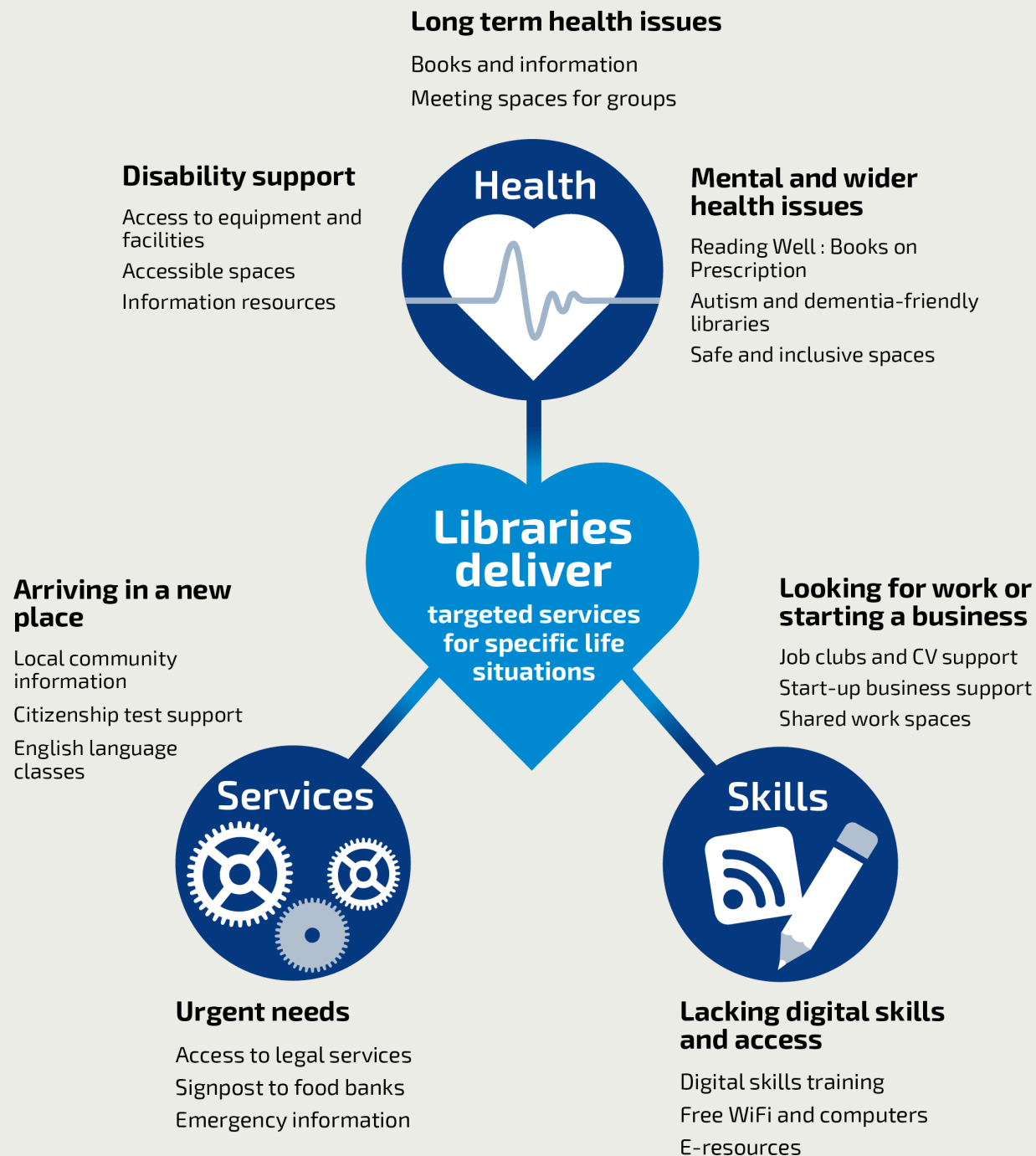
Figure 2: Examples of targeted services which libraries provide for specific life situations