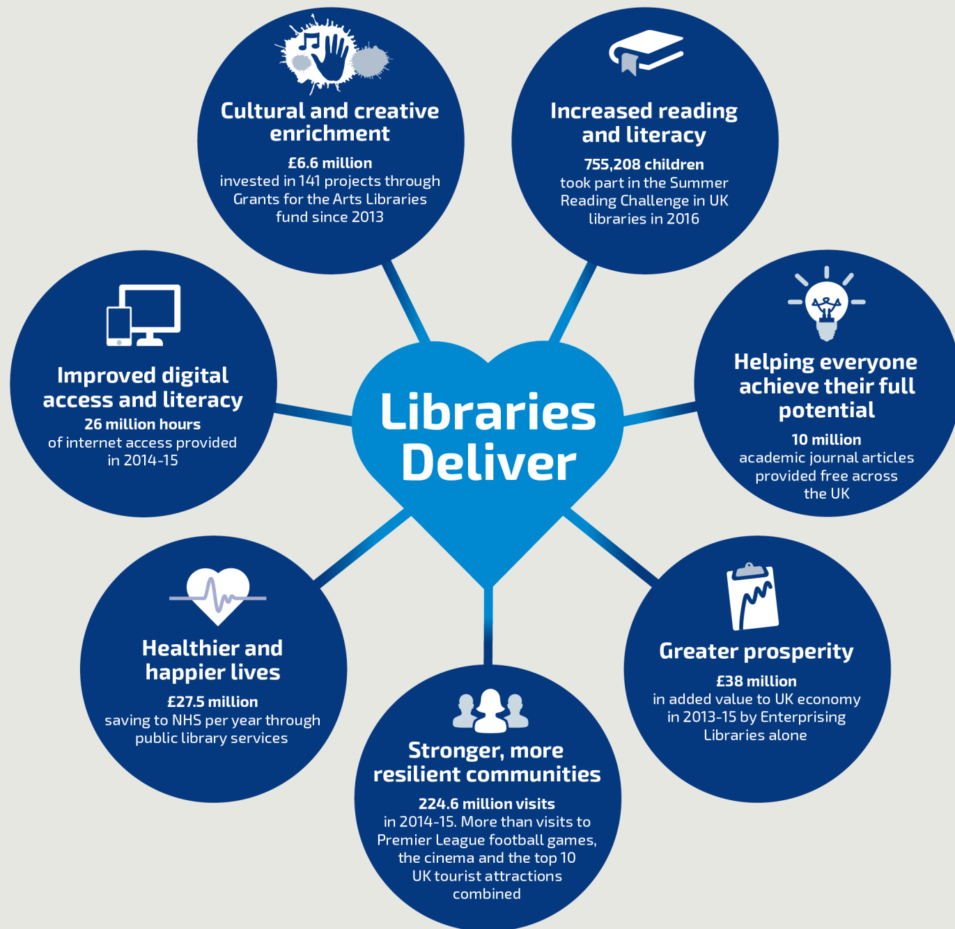
Figure 3: Library services deliver against 7 Outcomes