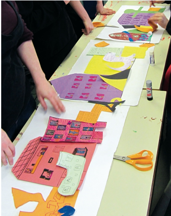
Helix Arts, Cityscape in Progress.