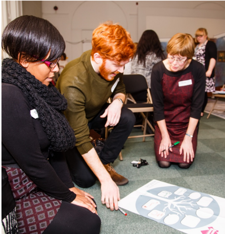
National Museums Liverpool's House of Memories project.